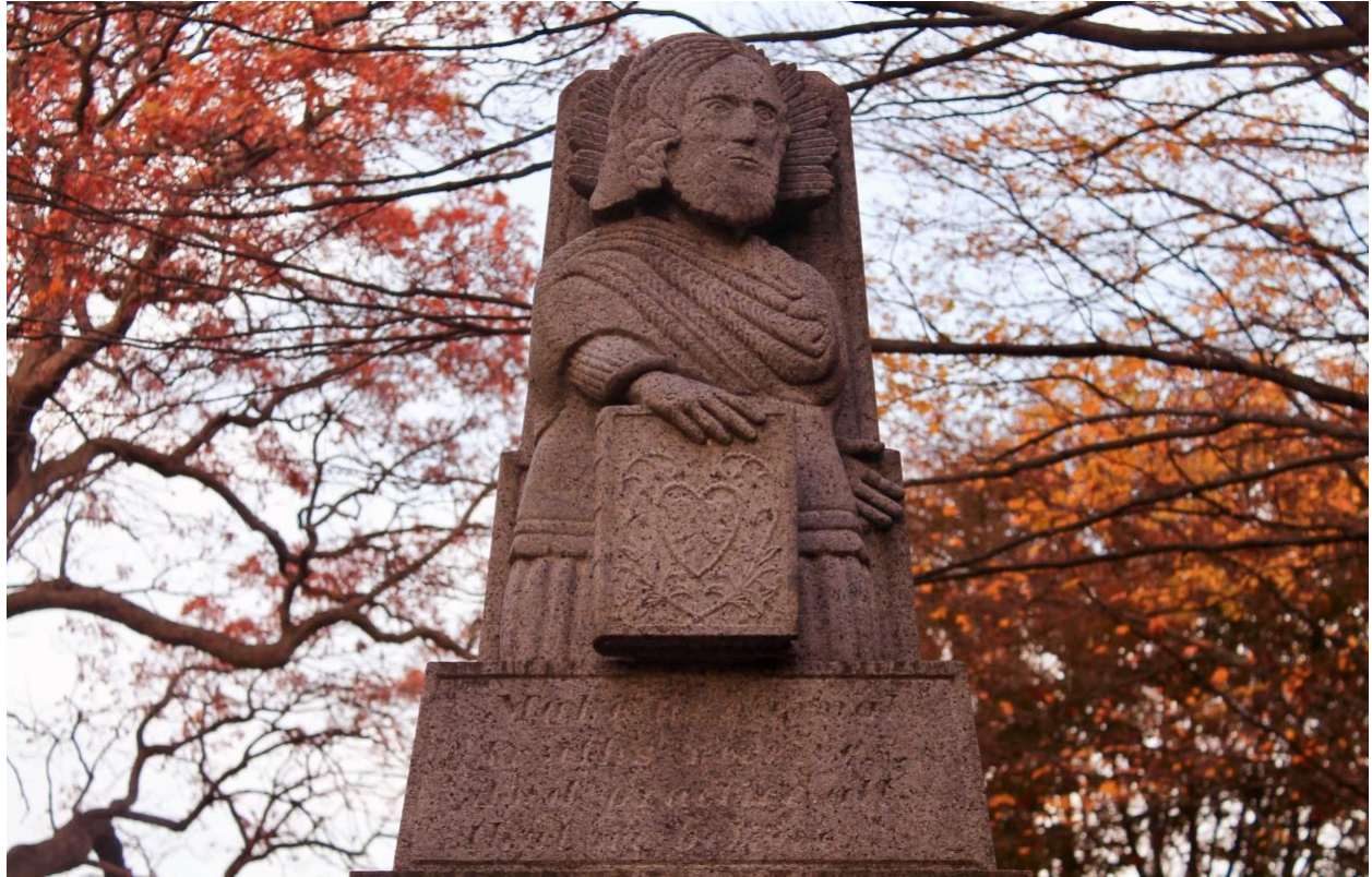
Mount Auburn Cemetery