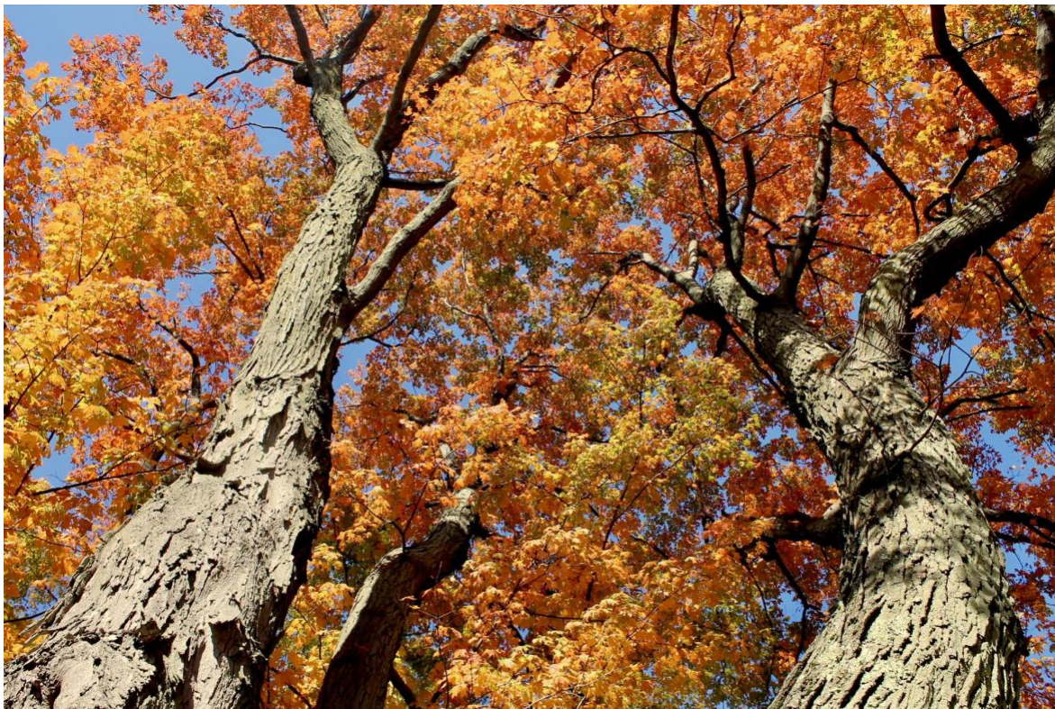
Mount Auburn Cemetery