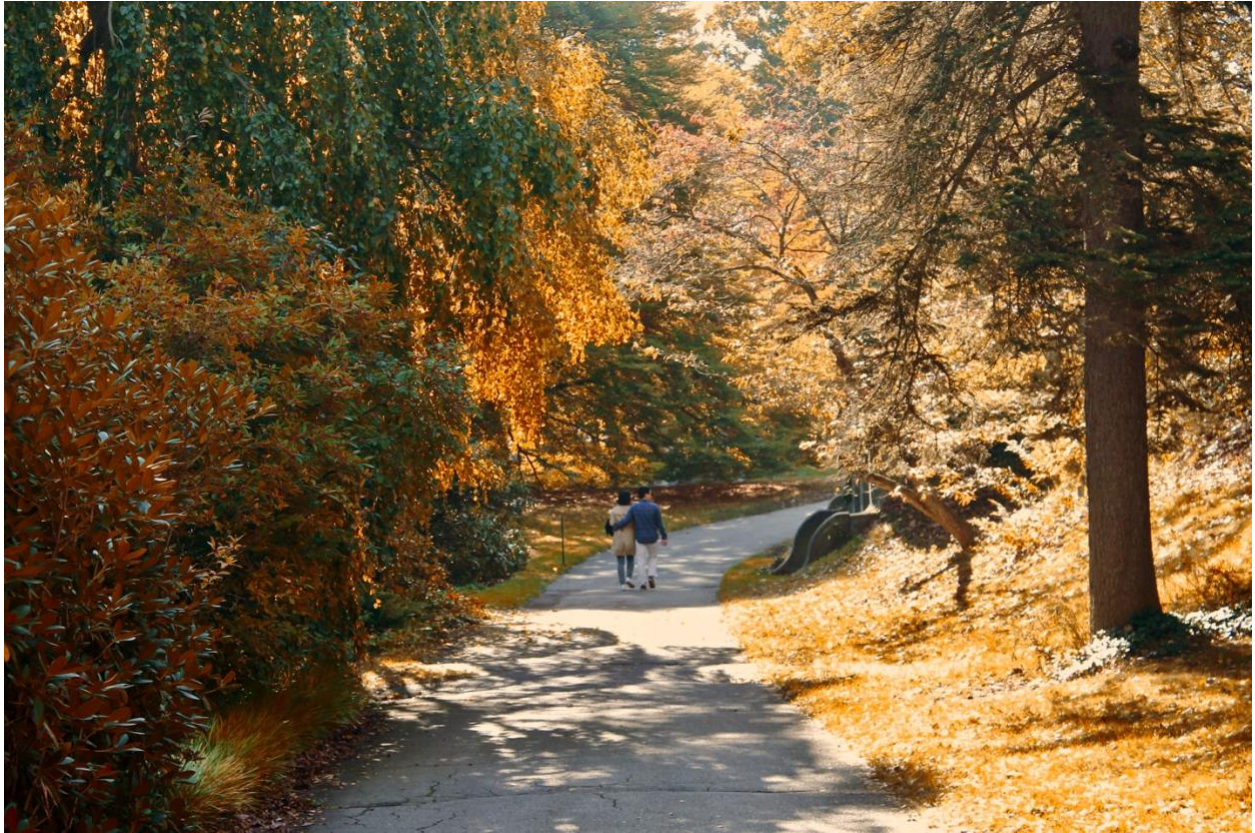
Mount Auburn Cemetery