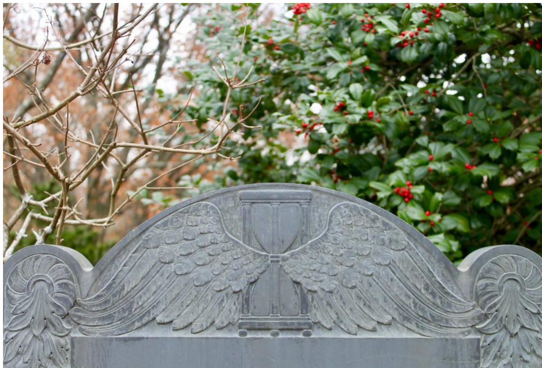
Mount Auburn Cemetery