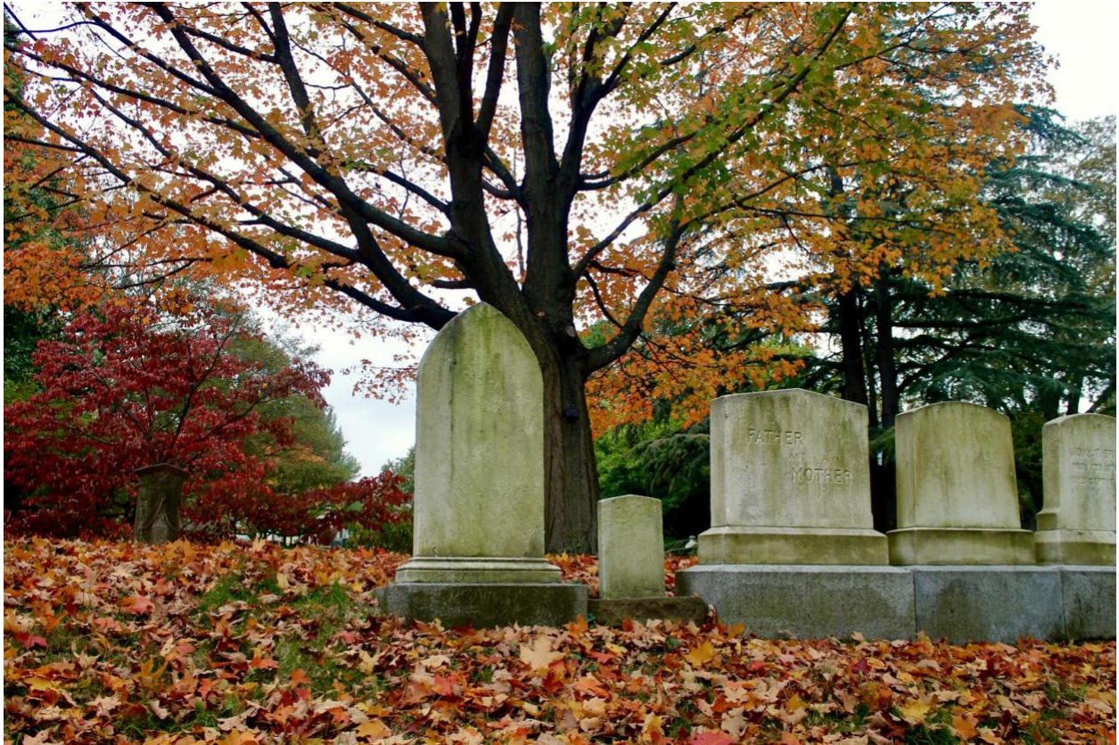
Mount Auburn Cemetery

* 9:30am-4:30 pm The Natural Deathcare Collaborative – In Loving Hands: A Practical & Community Approach to Deathcaring