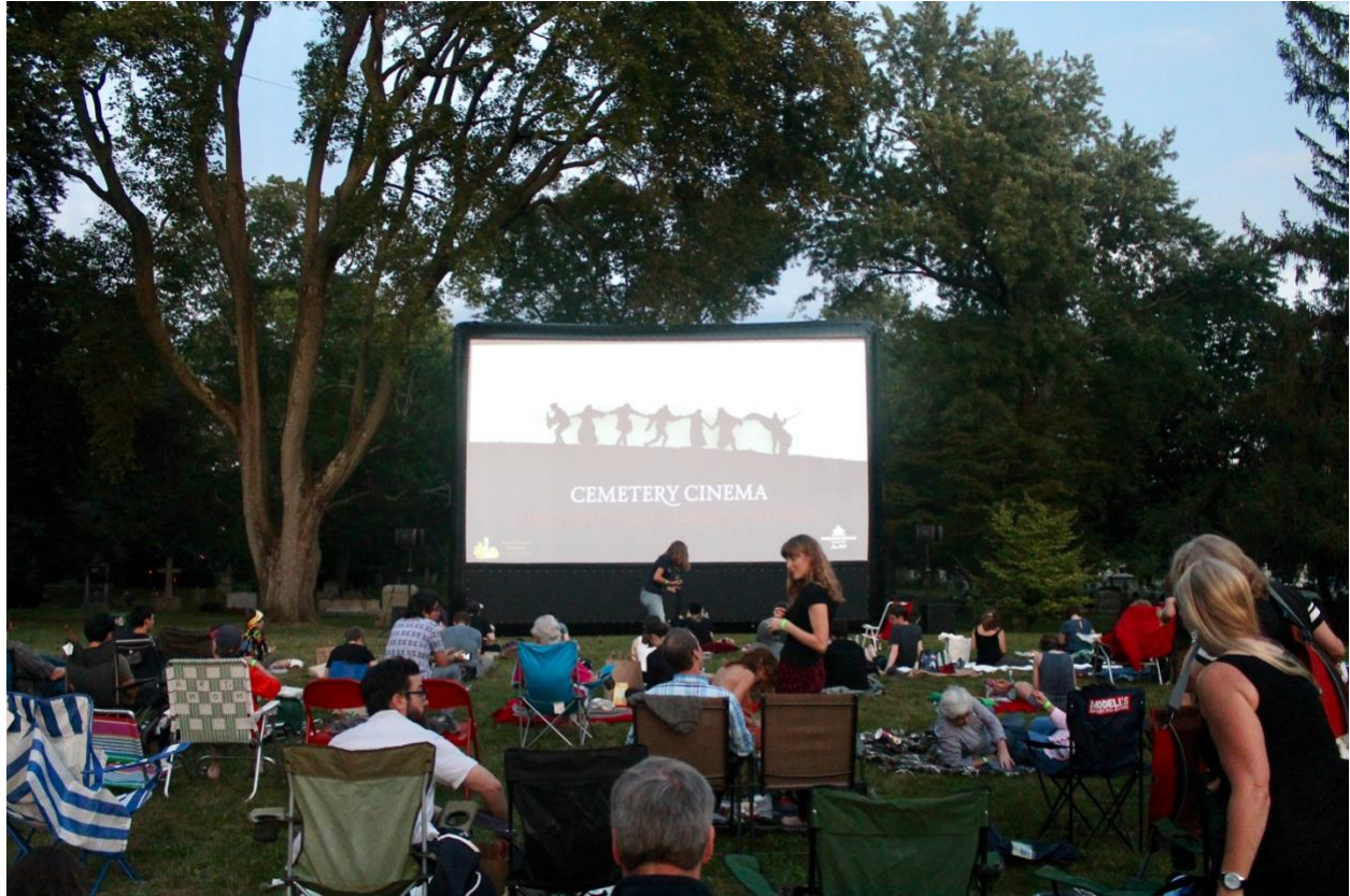
Cemetery Cinema

Mount Auburn Cemetery 580 Mt Auburn St., Cambridge MA 02138