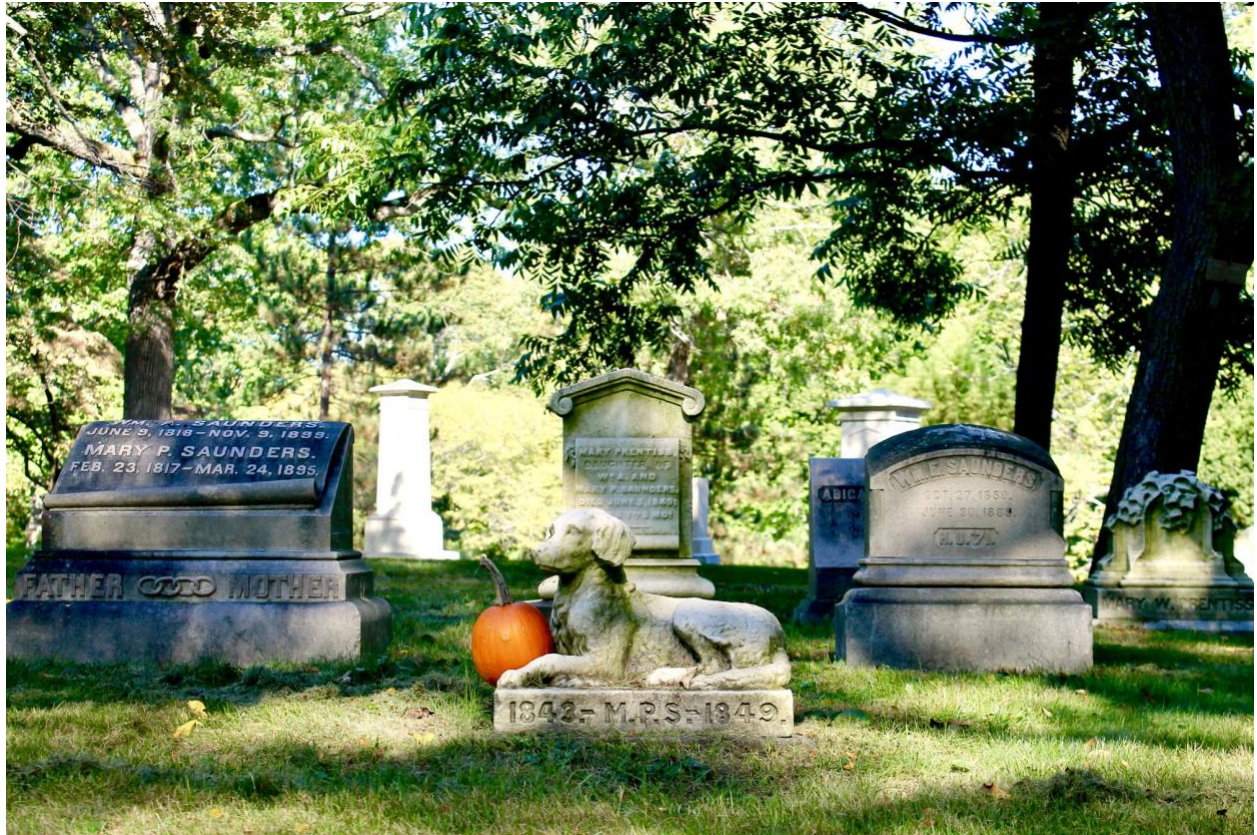
Mount Auburn Cemetery